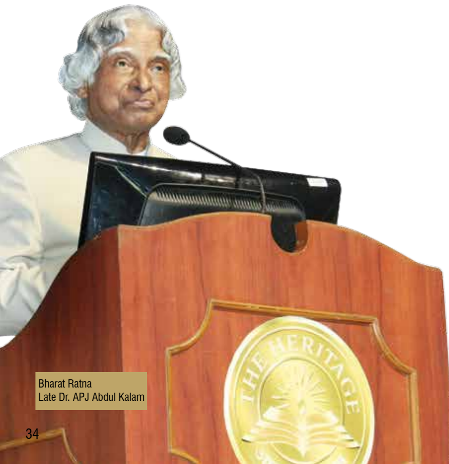
Bharat Ratna Late Dr. APJ Abdul Kalam