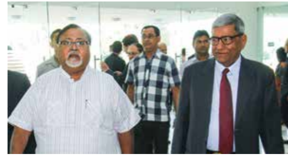
Shri Partha Chatterjee Minister of Education, West Bengal