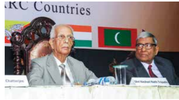
His Excellency Shri Keshari Nath Tripathi, Former Governor of West Bengal